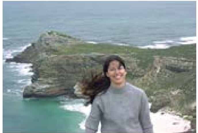
Cape Point South Africa

The more the prison tried to restrict information the harder they worked to share it. If someone smuggled in a newspaper, prisoners would memorize stories so that they could be passed on to everyone. They found ways to use the oil and fat from the meals to write messages on paper that could not be seen unless held next to matches. These efforts were so intense and the prisoner's stance was so spirited that even the wardens (wardens or guards) became sympathetic to the cause and had to be regularly replaced. Eventually they got the right to have more freedom and books and the learning that took place helped to end the oppressive system of Aparthe